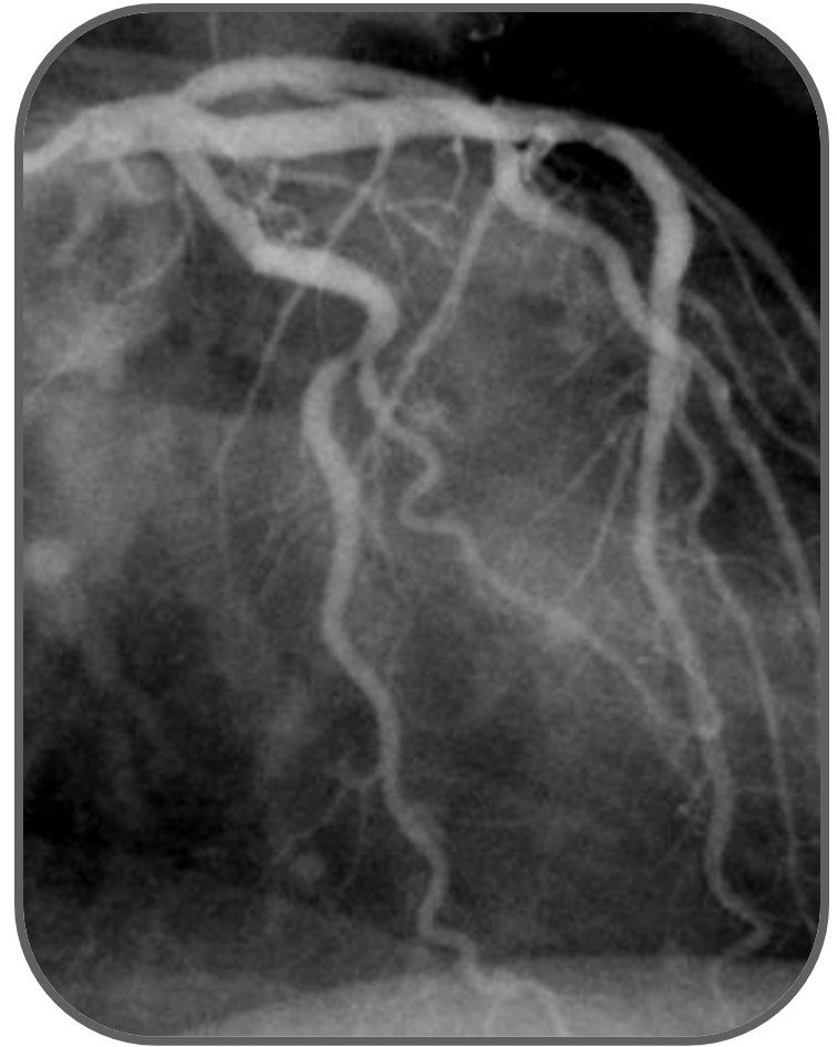
8 months follow up